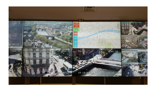
Fig. 1. DCC's traffic control center. INSIGHT system is running at the top monitor

Data Sources. Our system analyzes heterogeneous streaming data from the following input sources: (i) Buses that transmit their GPS location and information regarding their route. (ii) SCATS sensors that are deployed at intersections and transmit traffic flow measurements and the degree of saturation. (iii) Tweets that are posted by users in the Dublin area. (iv) Crowdsourcing input from users that provide feedback by reporting an event or answering to dynamic system queries using the CrowdAlert app from their mobile devices (see Fig. 2).