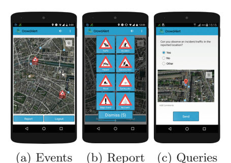
Fig. 2. CrowdAlert app