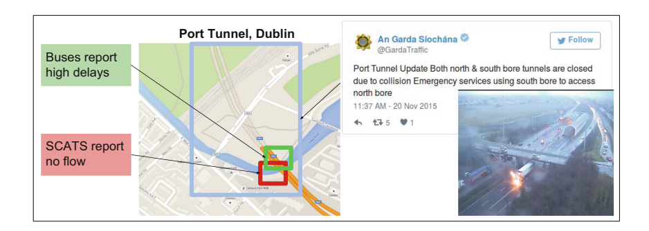
Fig. 4. Visualization of a fire event in Port Tunnel, Dublin

We will demonstrate the web interface and the CrowdAlert app that visualize the detected events, from the different ISAs . During the demonstration, both, real-time, and historical data will be available, to highlight multiple aspects of the system. An example of an identified fire event is shown in Fig. 4.